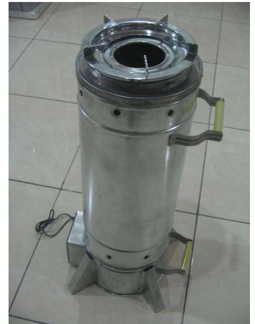
With Drum-Type Burner